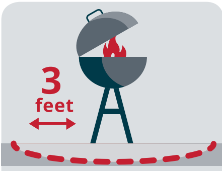
Keep a 3-foot safe zone around your grill. This will keep kids and pets safe.