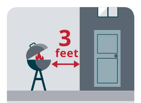
Only use your grill outside. Keep it at least 3 feet from siding, deck rails and eaves.