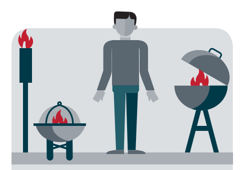
Keep an eye on your grill, fire pit or patio torches. Don't walk away from them when they are lit.